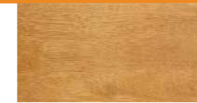
CATEGORY 2: Timber (timber, plywood, resin ply, shutter board)